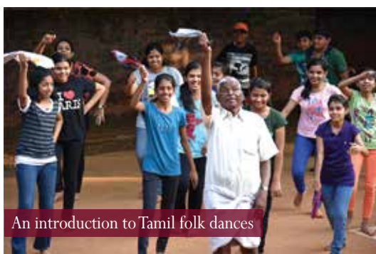
An introduction to Tamil folk dances